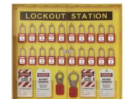
Parts for Reference