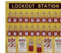
Parts for Reference