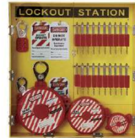
Parts for Reference