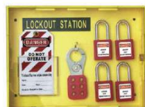
Parts for Reference