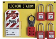
Parts for Reference