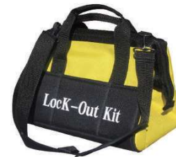
Parts for reference